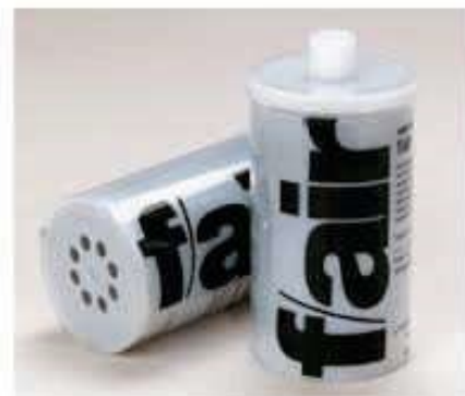
Activated Charcoal Canisters