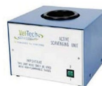
Non-ducted Active Scavenging