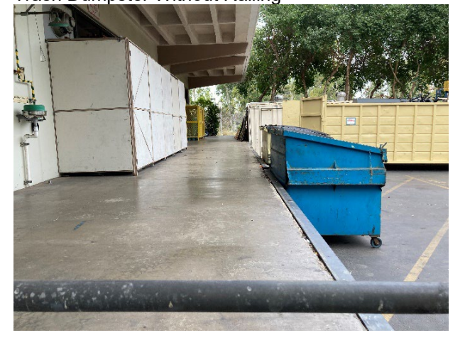
Trash Dumpster with Railing