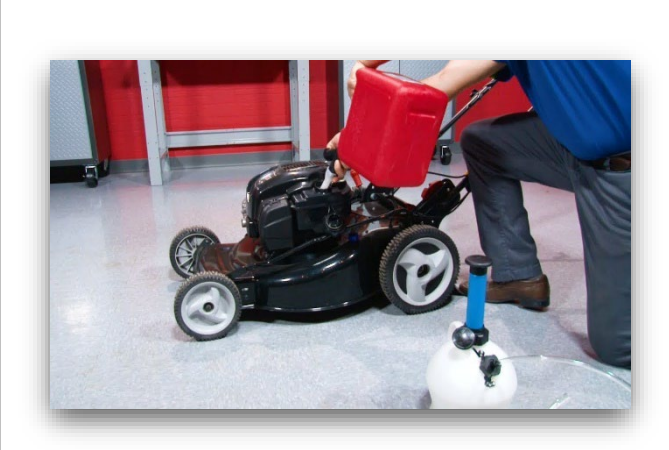
Do not refuel equipment near storm drains.