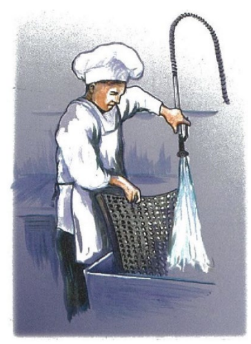
Clean floor mats, filters, and garbage cans in a mop sink or over an indoor floor drain. Don't wash them in a parking lot, alley, sidewalk, or street.

Help improve water quality by minimizing pollutants such as trash, chemicals, and eroded soil from entering the storm drain. Prior to an anticipated rain event, please inspect your area and review these guidelines.