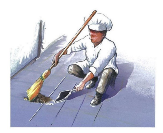
Clean using a broom or mop instead of hosing the area with water.