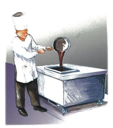
Recycle grease and oil. Don't pour it into sinks, floor drains, onto a parking lot, or street.