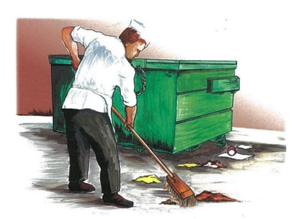
Keep trash area clean and dumpster lids closed. Don't fill it with liquid waste or hose it out.